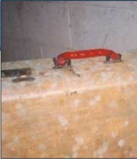
Mold growing on a suitcase stored in a humid basement.

It is important to take precautions to LIMIT YOUR EXPOSURE to mold and mold spores.