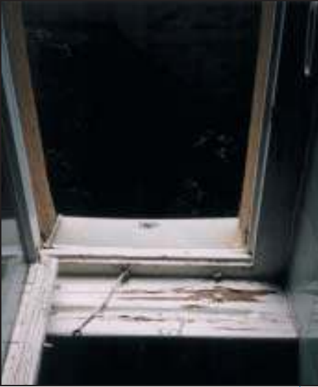
Leaky window – mold is beginning to rot the wooden frame and windowsill.

If you already have a mold problem – ACT QUICKLY.