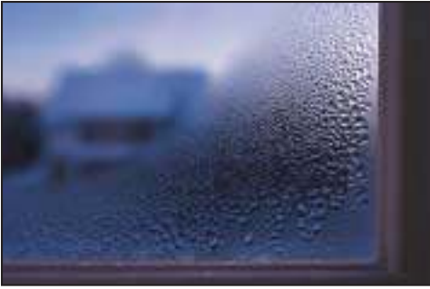
Condensation on the inside of a windowpane.