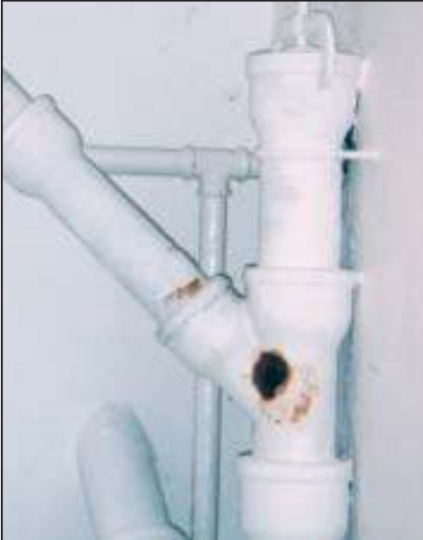
Rust is an indicator that condensation occurs on this drainpipe. The pipe should be insulated to prevent condensation.

Renters: Report all plumbing leaks and moisture problems immediately to your building owner, manager, or superintendent. In cases where persistent water problems are not addressed, you may want to contact local, state, or federal health or housing authorities.