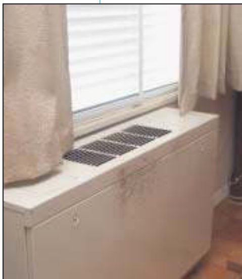
Mold growing on the surface of a unit ventilator.