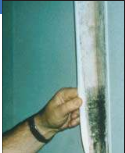
Mold growing on the back side of wallpaper.

Suspicion of hidden mold You may suspect hidden mold if a building smells moldy, but you cannot see the source, or if you know there has been water damage and residents are reporting health problems. Mold may be hidden in places such as the back side of dry wall, wallpaper, or paneling, the top side of ceiling tiles, the underside of carpets and pads, etc. Other possible locations of hidden mold include areas inside walls around pipes (with leaking or condensing pipes), the surface of walls behind furniture (where condensation forms), inside ductwork, and in roof materials above ceiling tiles (due to roof leaks or insufficient insulation).