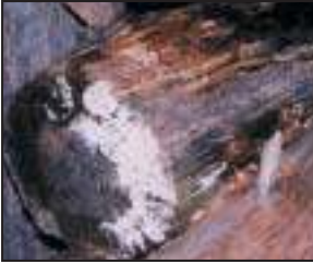
Mold growing outdoors on firewood. Molds come in many colors; both white and black molds are shown here.

Molds are part of the natural environment. Outdoors, molds play a part in nature by breaking down dead organic matter such as fallen leaves and dead trees, but indoors, mold growth should be avoided. Molds reproduce by means of tiny spores; the spores are invisible to the naked eye and float through outdoor and indoor air. Mold may begin growing indoors when mold spores land on surfaces that are wet. There are many types of mold, and none of them will grow without water or moisture.